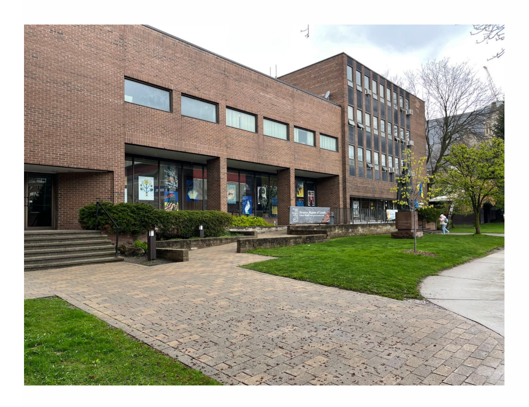
This is what the building looks like if you are coming north from Harbord St.

This is what the building looks like if you are coming south from Willcocks St.