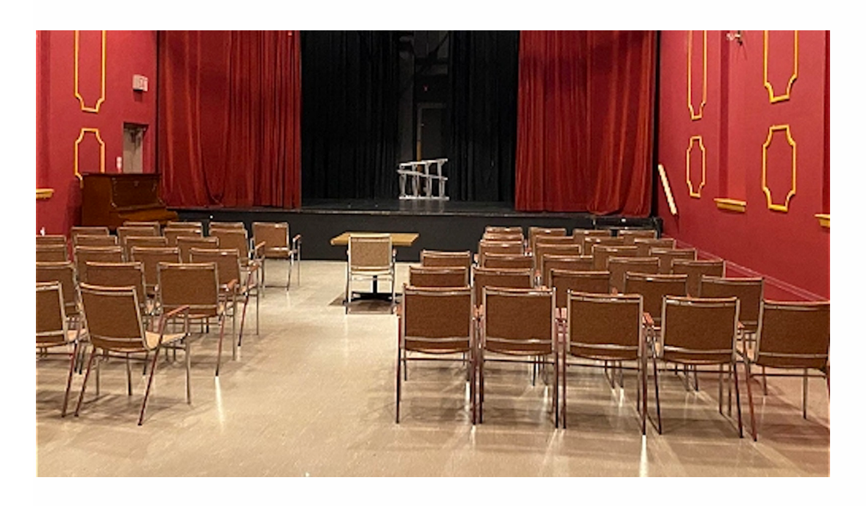
This is what the stage may look like from the audience.

This is where you will sit and watch the show. You can sit in whichever seat you like! Chairs can be removed or rearranged to accommodate mobility devices as needed.